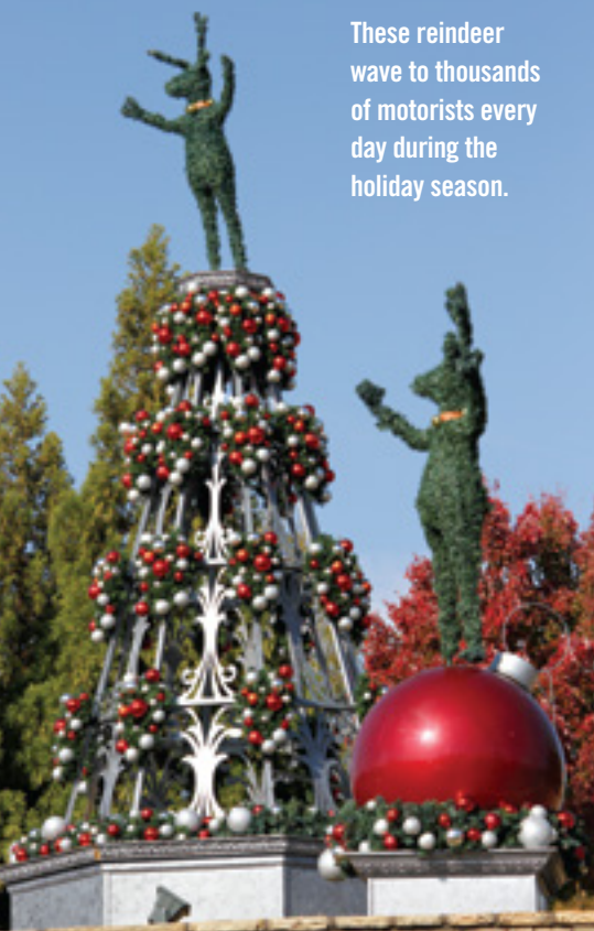
These reindeer wave to thousands of motorists every day during the holiday season.

win a prize Guess the location of this scene found within Walton EMC's service territory. We'll draw from the winners of all correct guesses for a $25 gift card.